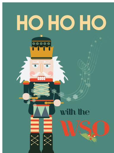
Ho, Ho, Ho WITH THE WSO SAT., DECEMBER 2, 2017 8 P.M. SUN., DECEMBER 3, 2017 3 P.M

With a Best of the Rest package, you receive a ticket to each of the three remaining concerts in the 2017-2018 season while saving more than 20% over the cost of buying each ticket individually! Offer ends December 3, so act today!