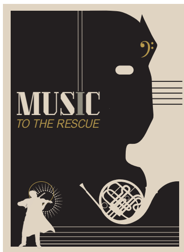
MUSIC TO THE RESCUE SUN., FEBRUARY 18, 2018, 3 P.M.

Give your friends and family the gift of music - bring them to join us at the WSO's annual holiday concert. The All-Star High School Choir helps us get back to basics this year as we unwrap a host of traditional carols that will be familiar to all. Young talent will also be highlighted by a sampling of character dances from Tchaikovsky's Nutcracker .